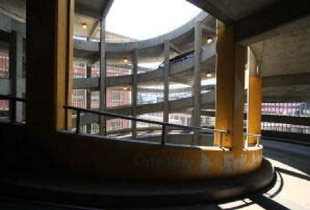
Multi Level Car Park.