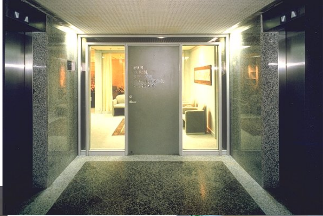
Lift Lobbies leading to the offices have granite cladding, ambient lighting and a pleasant décor.