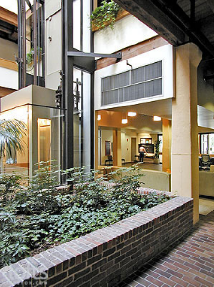
Landscaped Office Atrium with a Skylight.